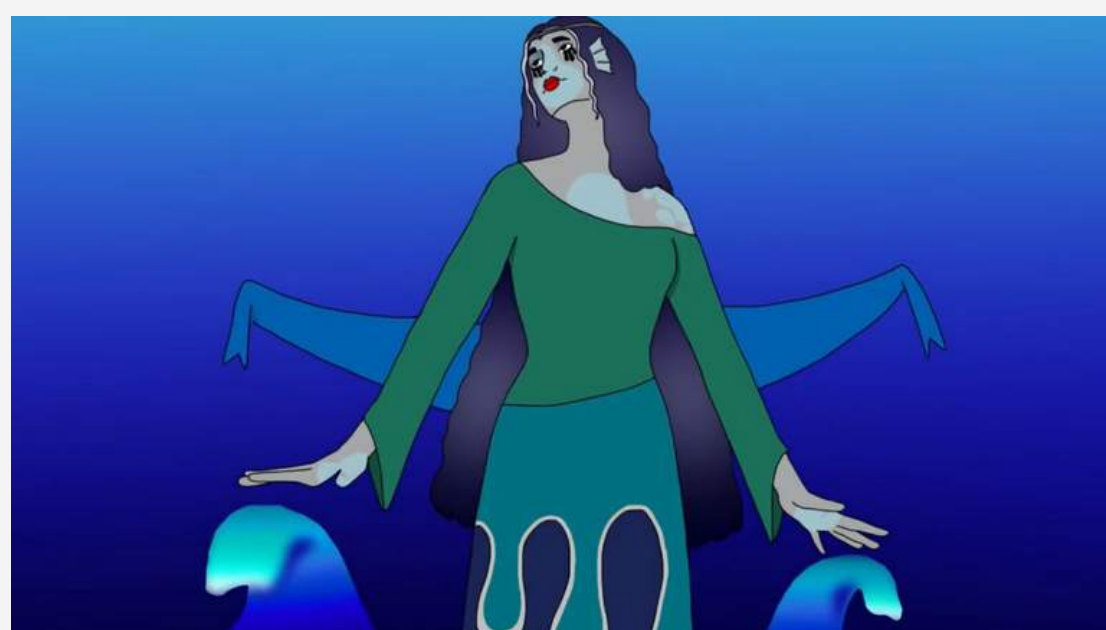
Music video by Godolphin and Latymer School