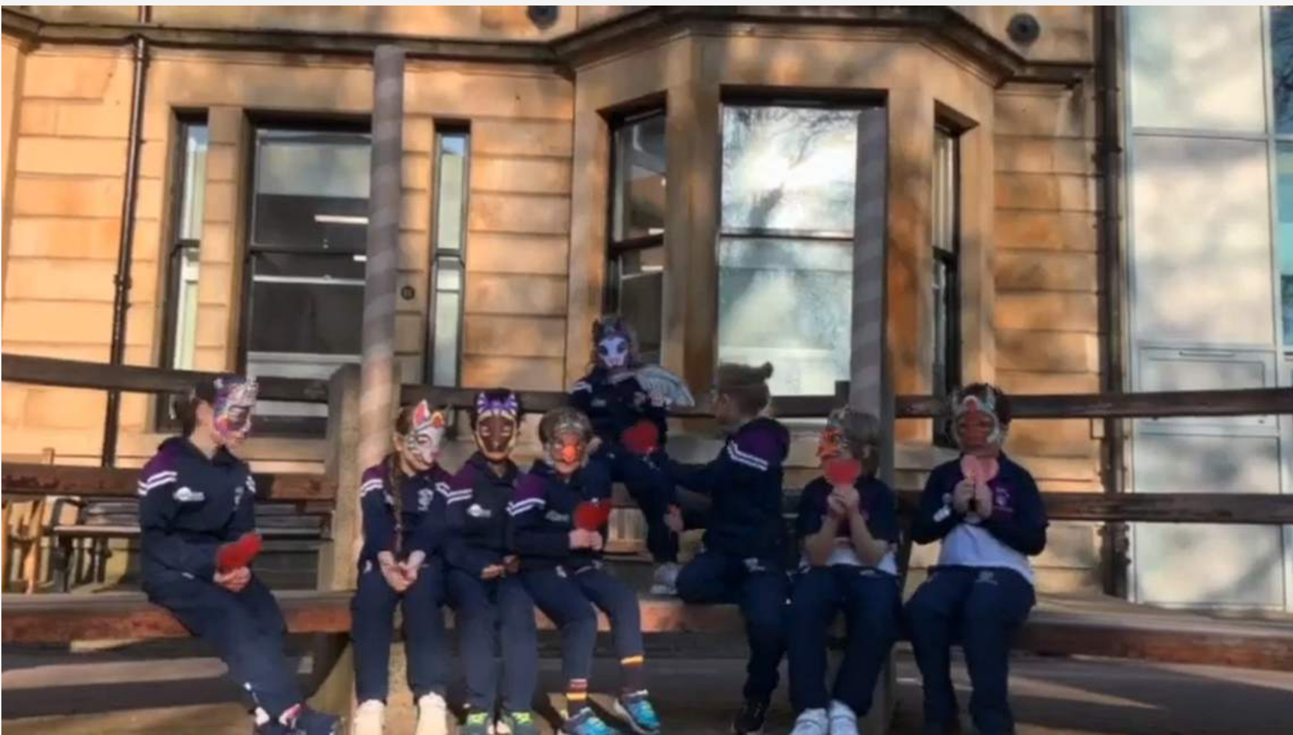
Music video by Glasgow Academy Primary School